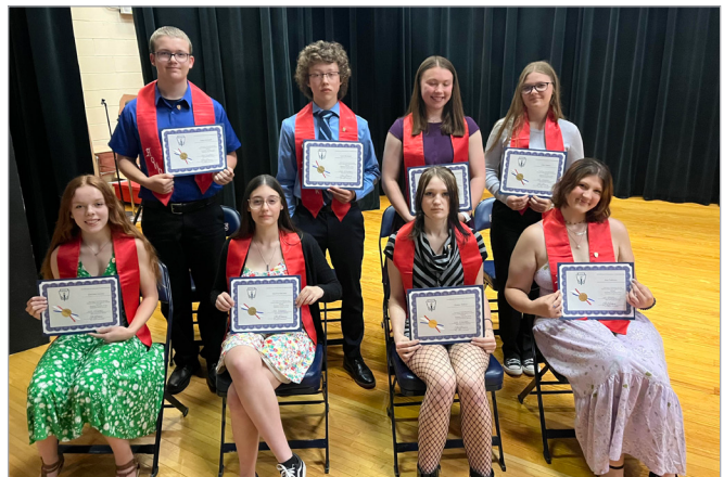
Eight students were inducted into the National Honor Society (NHS) on May 25.