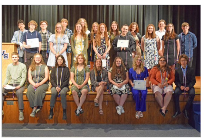
Congratulations to all the newly inductees of the English, History and Math Honor Societies.