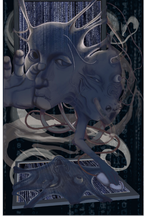
Compulsory Assimilation by Kyra Cornelia